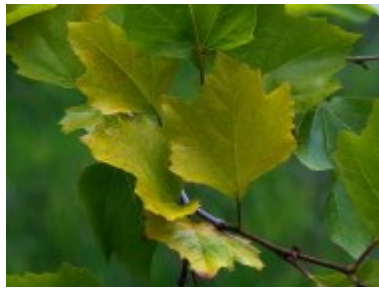
Alangium platanifolium var macrophyllum