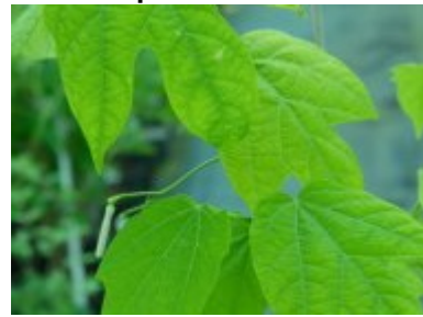
Alangium platanifolium var macrophyllum