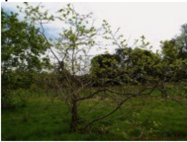
Alangium platanifolium var macrophyllum

The plant comes from Korea and Japan and we have found that it can experience some dieback on the previous year's new growth after a cold winter. It therefore needs to be grown in fertile well drained soil in dappled shade and surrounded by other shrubs for shelter. It can readily be grown against a wall and needs to be somewhere close to a path where you can appreciate its summer flowers and attractive leaf shape.