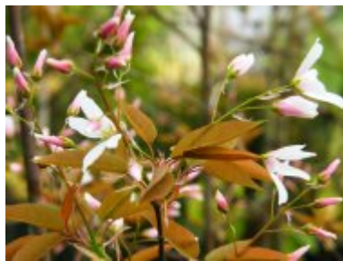
A. x grandiflora 'Robin Hill'