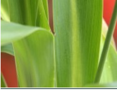
A. cirratum 'Matapouri Bay'