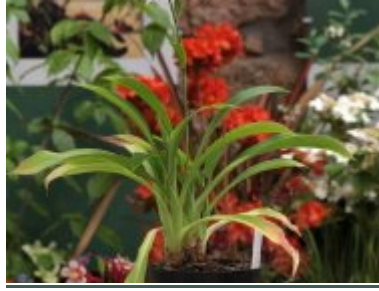
A. cirratum 'Matapouri Bay'

Burncoose Nurseries: Gwennap, Redruth, Cornwall TR16 6BJ