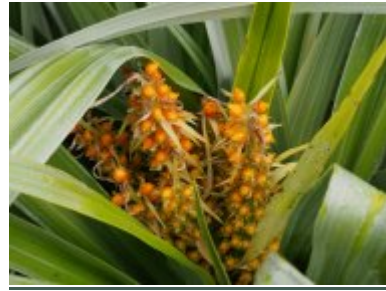
A. chathamica 'Silver Spear'