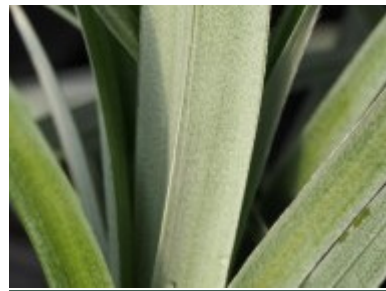
A. chathamica 'Silver Shadow'