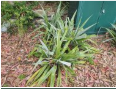
A. chathamica 'Silver Spear'