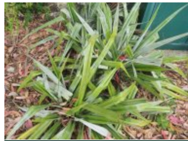
A. chathamica 'Silver Shadow'