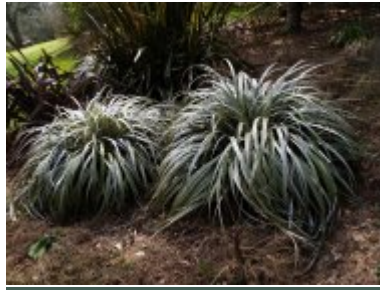
A. chathamica 'Silver Spear'