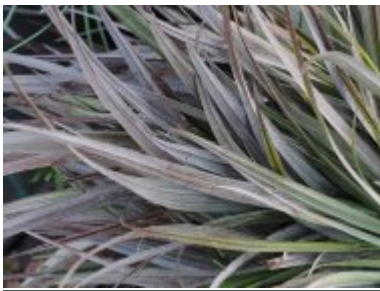
A. chathamica 'Silver Shadow'