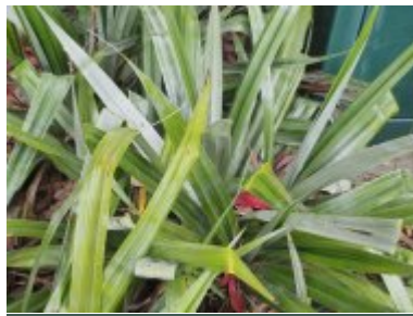
A. chathamica 'Silver Shadow'