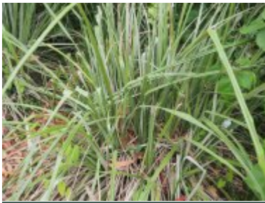
A. banksii 'Silver Sword'