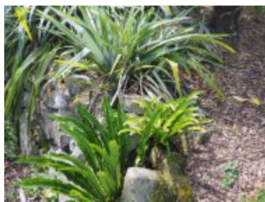
A. chathamica 'Silver Shadow' & Asplenium scolopendrium