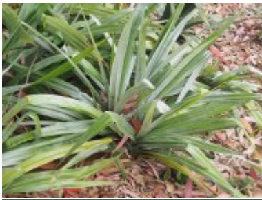
A. chathamica 'Silver Shadow'