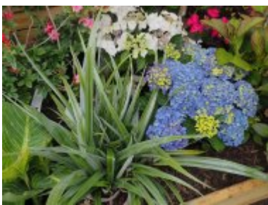
A. chathamica 'Silver Shadow' & Hydrangea 'Benelux'