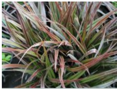
A. chathamica 'Silver Shadow'