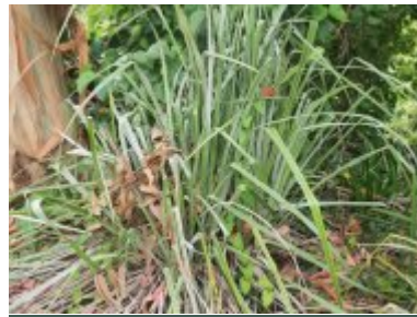
A. banksii 'Silver Sword'