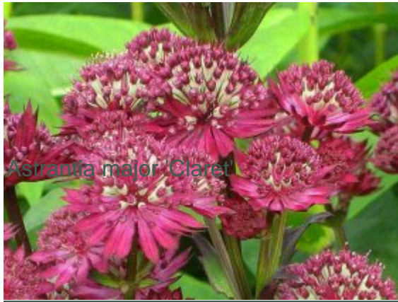
Astrantia major 'Claret'