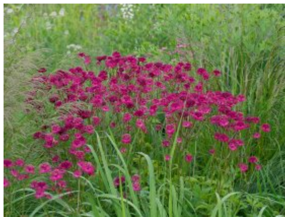
Astrantia major 'Claret'