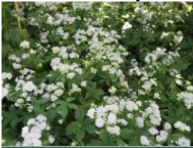
Astrantia major 'Alba'

garden. In autumn the plants need tidying up with the old leaves and stems removed to ground level and consigned to the compost heap. In hotter summers you may well be able to do this in August.