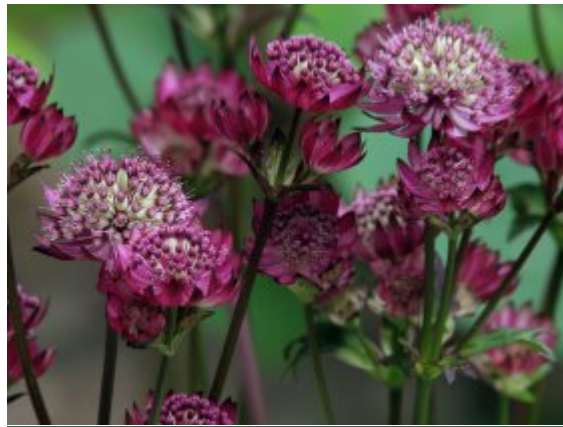
Astrantia carniolica 'Rubra'