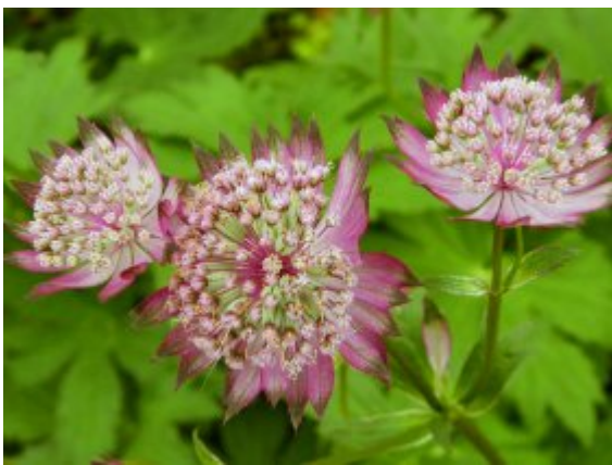
Astrantia 'Hadspen Blood'