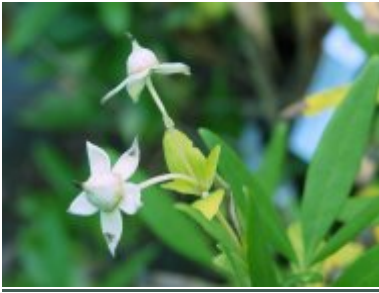
Carpenteria going to seed

Although you might perhaps doubt it to look at them as young plants carpenteria are frost hardy. They may defoliate slightly in severe cold but will survive.