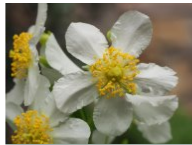
Carpenteria californica 'Ladhams Variety'