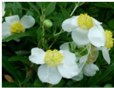
Carpenteria californica 'Elizabeth'