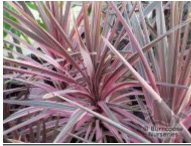
Cordyline australis 'Southern Splendour'