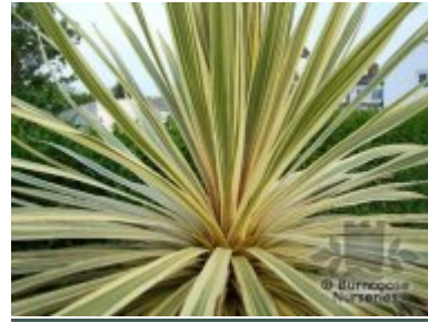
Cordyline australis 'Albertii'