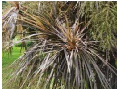
Cordyline australis 'Purpurea'