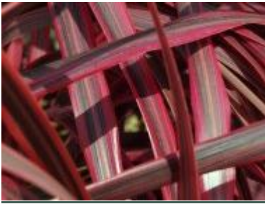
Cordyline australis 'Salsa'