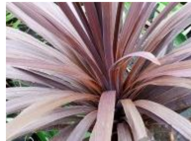
Cordyline australis 'Purpurea'