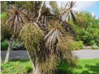
Cordyline australis 'Purpurea'

There are now many forms and varieties of C. australis which are almost as hardy. C. australis 'Albertii' has wonderful green cream and white variegations in its leaves. C. australis 'Purpurea' is smaller growing with brown leaves flushed purple. There are also newer forms with pink margined leaves ('Southern Splendour') and red central veining ('Sundance'). These are definitely more tender and untried even in Cornwall. It may therefore be best to keep them in the greenhouse until more established at least in colder counties.