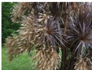
Cordyline australis 'Purpurea'