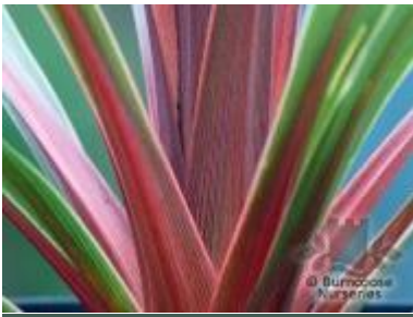
Cordyline australis 'Sundance'

If your Cordyline (Cabbage Palm) has suffered in the Winter and its crown appears brown and dead (even if there are still green leaves below) it will soon die. To save it you need to take drastic action and cut off the top. New vigorous shoots will appear from the base of the plants or perhaps up the stem as well.