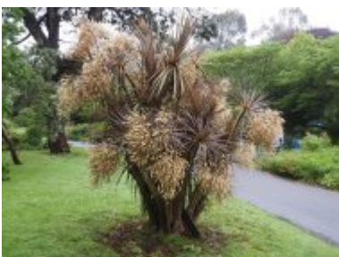
Cordyline australis 'Purpurea'