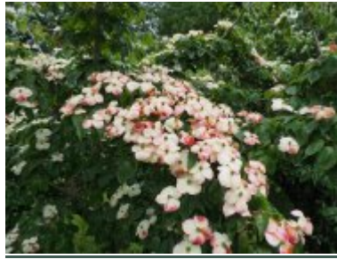
Cornus kousa 'Rasen'