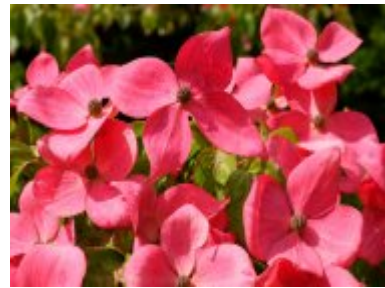
Cornus kousa 'Miss Satomi'

probably the best pink form of C. kousa that is available.