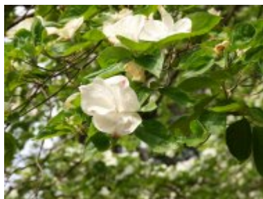
Cornus x 'Eddie's White Wonder'

A vigorous growing C. florida hybrid with enormous white bracts from a young age