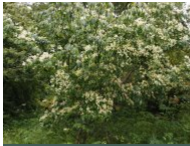
C.kousa 'Madame Butterfly'

Widely recognised as the most beautiful of the red bracted cornus