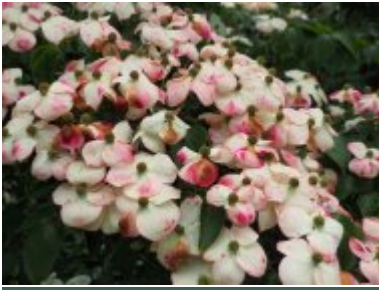
Cornus kousa 'Rasen'