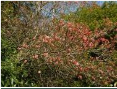
Cornus florida 'Cherokee Chief'

Widely recognised as the most beautiful of the red bracted cornus