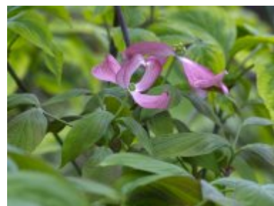
Cornus florida 'Cherokee Chief'

('Royal Red') – its branches are covered with inflorescences which are a vivid and brilliant red.