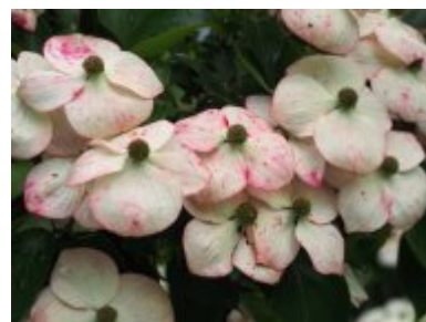
Cornus kousa 'Rasen'