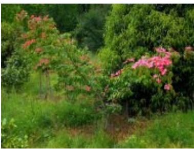
Cornus kousa 'Miss Satomi'

probably the best pink form of C. kousa that is available.