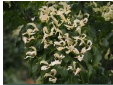
C.kousa 'Madame Butterfly'