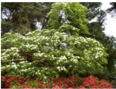
Cornus x 'Eddie's White Wonder'

A vigorous growing C. florida hybrid with enormous white bracts from a young age