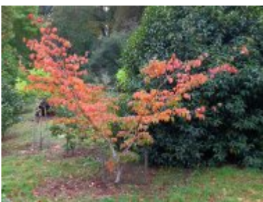
Cornus kousa 'Miss Satomi'