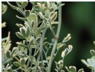
Coronilla valentina subsp. glauca 'Variegata'