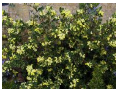
Coronilla valentina subsp. glauca 'Citrina'