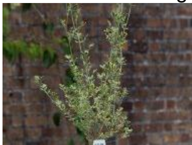
Coronilla valentina subsp. glauca 'Variegata'

Coronilla are easily propagated from seed sown when ripe in a cold frame or as softwood cuttings in early summer.