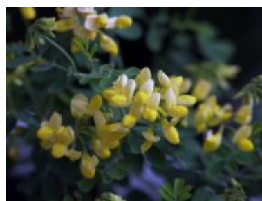
Coronilla valentina subsp. glauca 'Citrina'