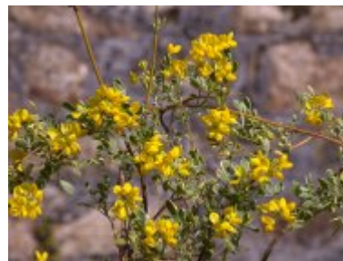
Coronilla valentina subsp. glauca 'Variegata'