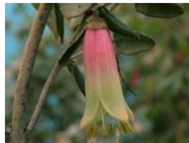
Correa 'Marian's Marvel'