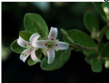
Correa alba 'Pinkie'

We sometimes offer other species of correa but these should be regarded as even more tender greenhouse plants.