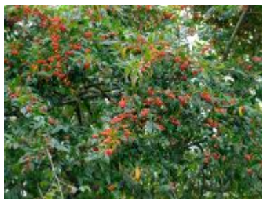
Cotoneaster 'Hybridus Pendulus'