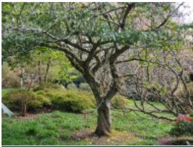
Cotoneaster frigidus 'Inchmery'