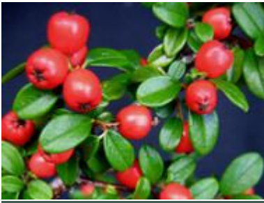
Cotoneaster 'Coral Beauty'