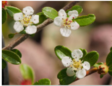
Cotoneaster 'Coral Beauty'

C. conspicuus is a dense mound forming evergreen growing up to around 5ft but with a greater spread. Shiny red fruit in profusion.