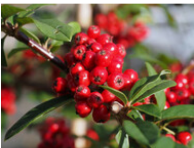
Cotoneaster 'Hybridus Pendulus'