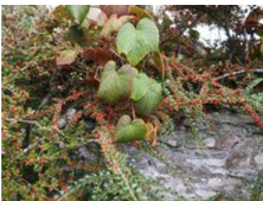
Cotoneaster horizontalis & Vitis coignetiae