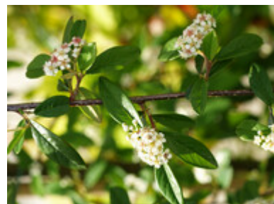
Cotoneaster 'Hybridus Pendulus'