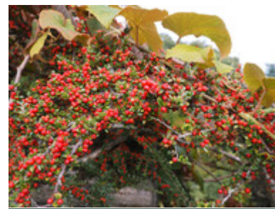
Cotoneaster horizontalis & Vitis coignetiae