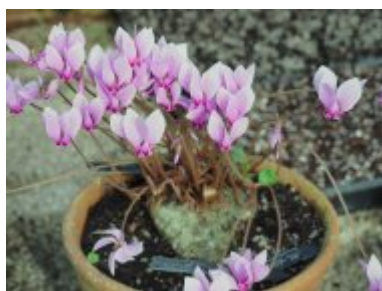
Cyclamen in a pot