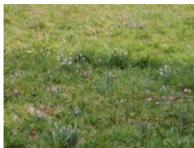
Cyclamen & snowdrops