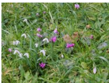
Cyclamen & snowdrops