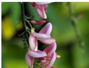
C. x praecox 'Hollandia'