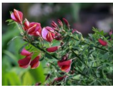
C. scoparius 'Burkwoodii'