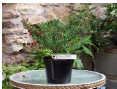
C. scoparius 'Burkwoodii'