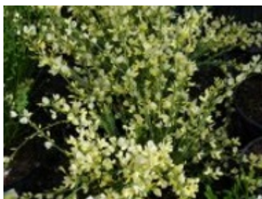
Cytisus x praecox