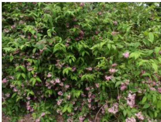
Deutzia 'Strawberry Fields'