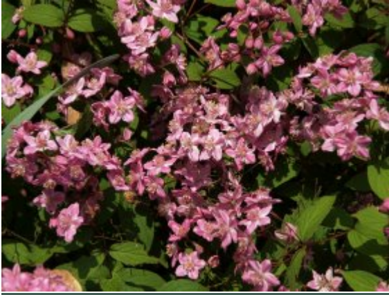
Deutzia elegantissima 'Rosealind' a compact, rounded but upright shrub with star shaped pink flushed white flowers.

View this video on Youtube here https://www.youtube.com/LbAK2BMOWuo