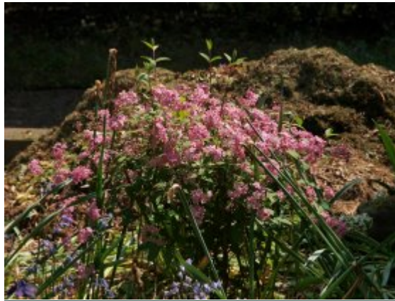
Deutzia x elegantissima 'Rosealind'