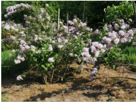
Deutzia x elegantissima 'Rosealind'

may well be helpful in encouraging more subsequent flowering. These plants can also readily be cut back hard if necessary in a border when they are dormant.