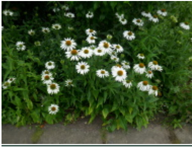
E. purpurea 'White Meditation'