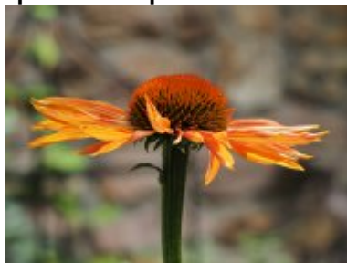
E. 'Big Kahuna'