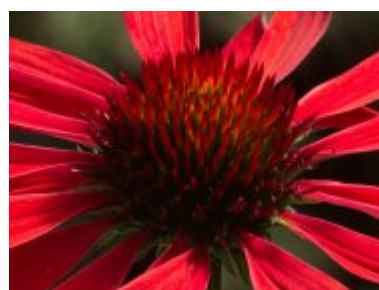
E. purpurea 'Hot Summer'