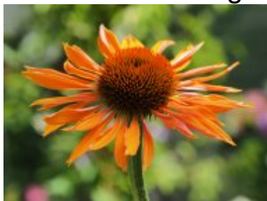
E. 'Big Kahuna'

Echinacea partner well with other darker green herbaceous plants which grow taller and lower than they do. Echinops, eryngium, canna and leucanthemum are good partner plants.