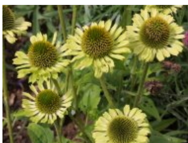
E. 'Green Jewel'