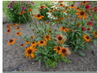
E. 'Tiki Torch'

Burncoose Nurseries: Gwennap, Redruth, Cornwall TR16 6BJ