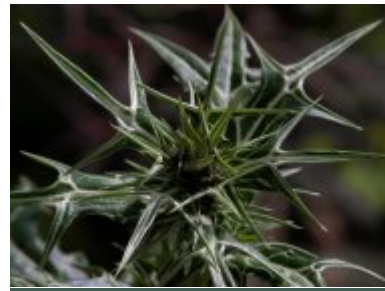
E. x tripartitum – herbaceous perennial

These represent the majority of the species which we offer. They can readily be grown in well drained, poor to only moderately fertile soil in full sun with some protection from winter wet. A coastal setting is ideal where there are hot dry sunny banks.