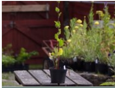
E. planum - evergreen perennial