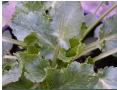
E. x tripartitum – herbaceous perennial