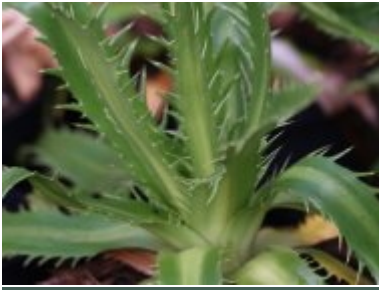
E. agavifolium – evergreen perennial

These have rather different requirements. They need a moist, well drained and fertile soil in full sun. You might easily conclude that these are best grown in wetter areas of the country.