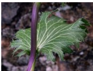
E. alpinum 'Blue Star' - herbaceous perennial