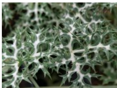
E. bourgatii 'Graham Stuart Thomas' - herbaceous perennial