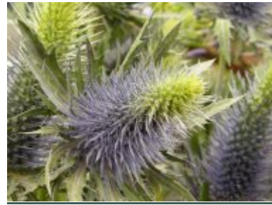
E. planum - evergreen perennial