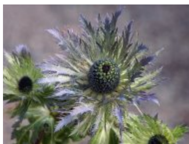
E. alpinum 'Blue Star' - herbaceous perennial