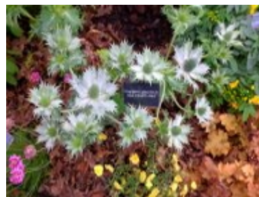
E. giganteum 'Miss Willmott's Ghost' - herbaceous perennial