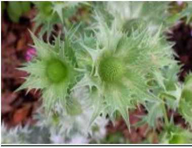
E. giganteum 'Miss Willmott's Ghost' - herbaceous perennial