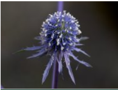
E. planum - evergreen perennial