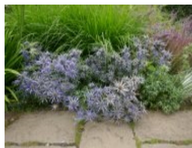
E. bourgatii 'Pico's Blue' - herbaceous perennial