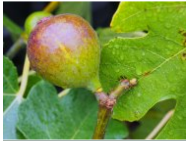
Ficus 'Brown Turkey'

On occasion we also offer the more tender Ficus pumila . This is a self-clinging and vigorous climber which grows extensively along one of our walled garden walls facing east. It has become well established after decades and is evergreen. In very hot summers we find occasional small figs but you have to look closely to hunt these out in the dense foliage. When grown under glass from cuttings this plant romps away and would certainly fruit better with winter heat.