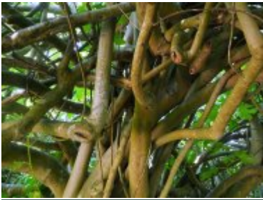
Ficus 'Brown Turkey'