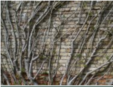
Ficus 'Brown Turkey'