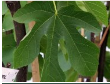
Ficus carica 'White Adriatic'