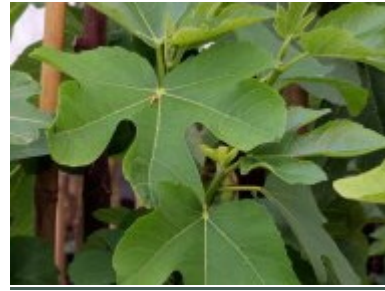
Ficus carica 'White Adriatic'

The plants which grow well in UK gardens are all females which have the power to produce fruit without being fertilised (like the cucumber). Pear shaped fruit receptacles develop into single fruits in profusion, especially after a hot dry summer. The fruits grow to up to 4in long and start off green maturing to dark green, purple or brown when finally ripe in September. Our plant at Burncoose has been pruned back hard against a wall but we do get some fruits most years although they are not always ripe enough to consider eating by early autumn after a wet summer.