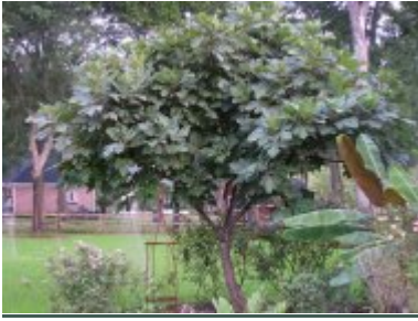
Ficus carica 'Celeste'