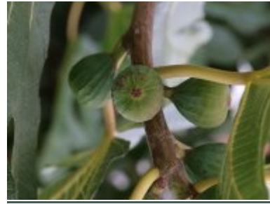
Ficus 'Brown Turkey'