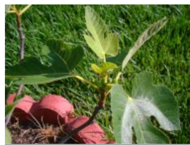
Ficus carica 'Celeste'