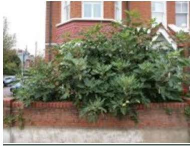
Ficus 'Brown Turkey'