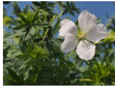
G. sanguineum 'Album'