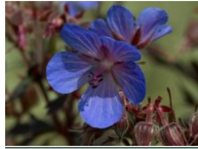
G. pratense 'Black Beauty'