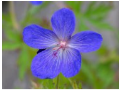
G. 'Johnson's Blue'