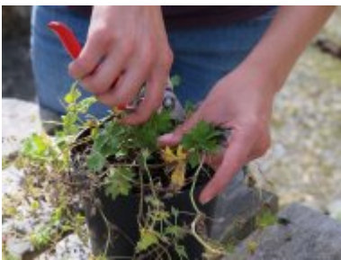
Geranium cutting back