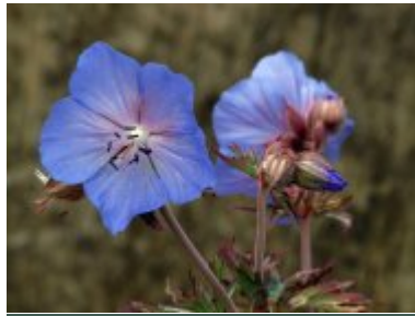
G. 'New Dimension'