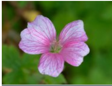
G. 'Wargrave Pink'