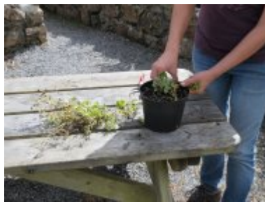
Geranium cutting back