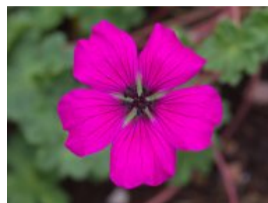
G. cinereum 'Purple Pillow'