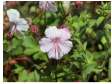
G. 'Purple Pillow'

View this video on Youtube here https://www.youtube.com/j1knAbNjx9U