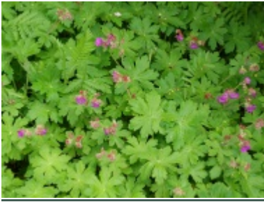
G. macrorrhizum 'Ingwersen's Variety'