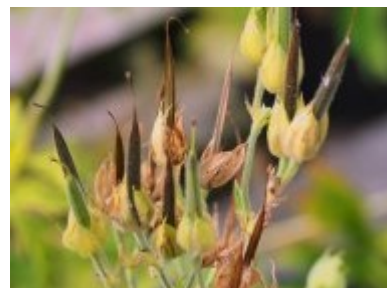
Geranium setting seed