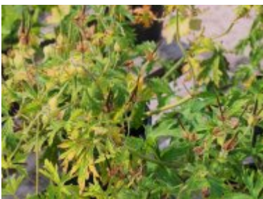
Geranium setting seed