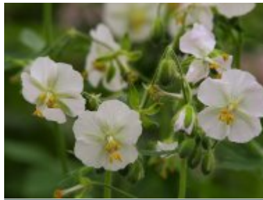
G. phaeum 'Album'