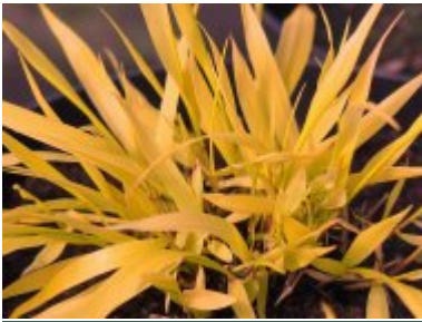
H. macra 'Sunflare'

Burncoose Nurseries: Gwennap, Redruth, Cornwall TR16 6BJ