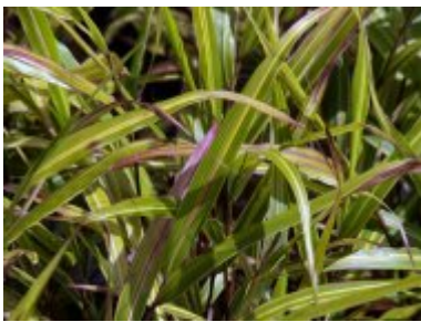
H. macra 'Albo Aurea'