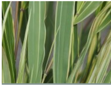
H. macra 'Albo Striata'