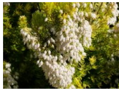
Erica arborea 'Albert's Gold'