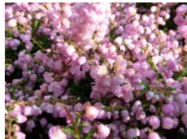
Calluna vulgaris 'County Wicklow'