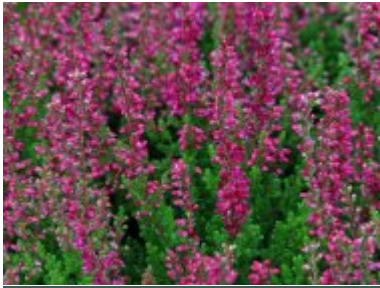
Calluna vulgaris 'Purple Passion'