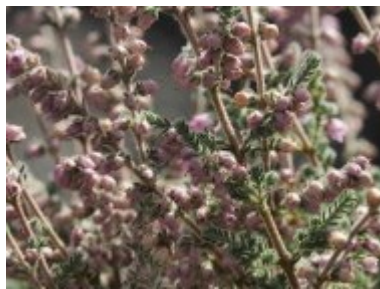
Calluna vulgaris 'Silver Fox'