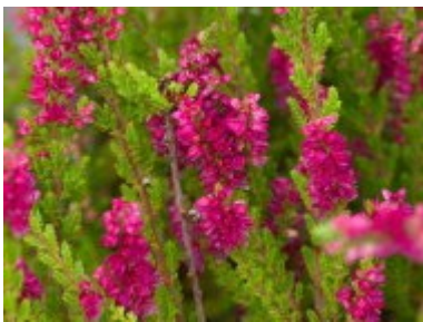
Calluna vulgaris 'Red Star'