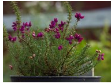
Erica cinerea 'Katinka'