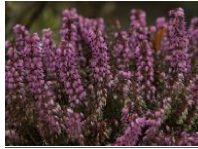
Erica carnea 'Heathwood'