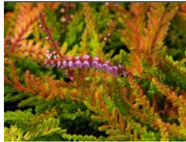
Calluna vulgaris 'Wickwar Flame'