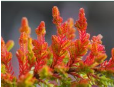
Calluna vulgaris 'Wickwar Flame'