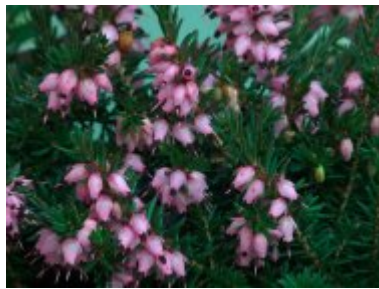
Erica x darleyensis 'Phoebe'