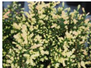
Calluna vulgaris 'Spring Cream'