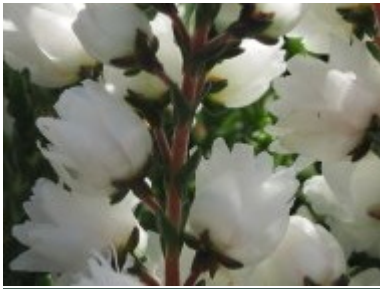
Calluna vulgaris 'Kinlochruel'