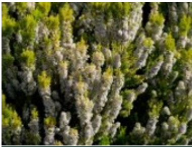
Erica arborea 'Albert's Gold'