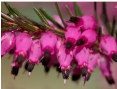
Erica x darleyensis 'Kramer's Red'