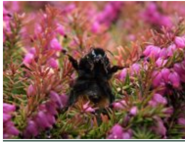
Erica carnea 'Eva Gold'