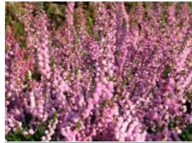
Calluna vulgaris 'Peter Sparkes'