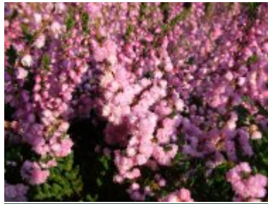
Calluna vulgaris 'Peter Sparkes'