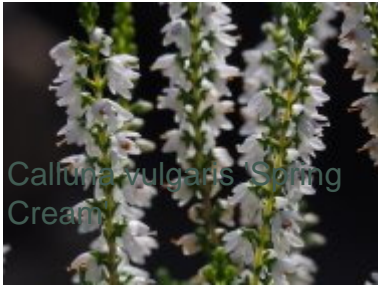
Calluna vulgaris 'Spring Cream'