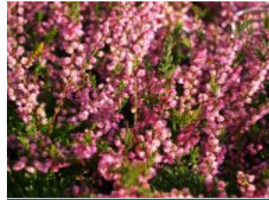
Calluna vulgaris 'Red Favorite'