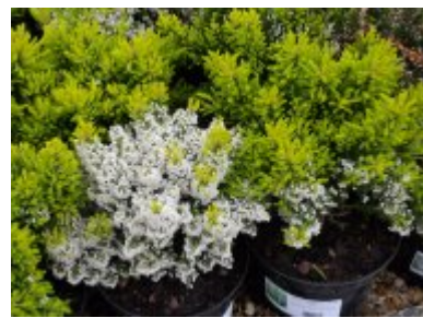
Erica arborea 'Estrella Gold'