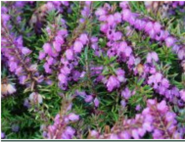
Erica carnea 'Eva Gold'