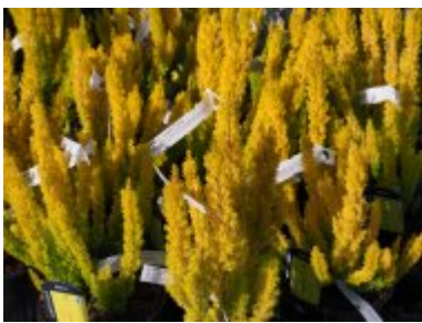
Erica arborea 'Albert's Gold'