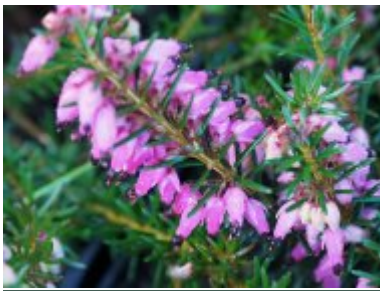
Erica carnea 'Myretoun Ruby'