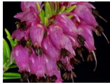
Erica x darleyensis 'Tweety'