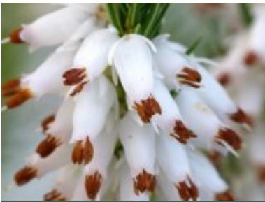
Erica carnea 'Isabell'