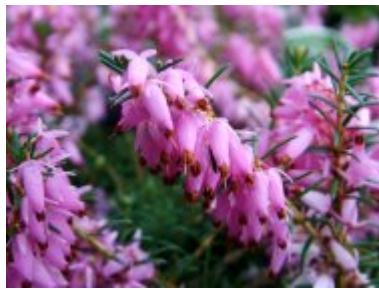
Erica carnea 'Pink Spangles'