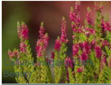
Calluna vulgaris 'Dark Beauty'