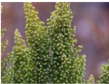
Erica arborea 'Estrella Gold'