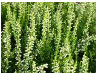
Calluna vulgaris 'Alicia'