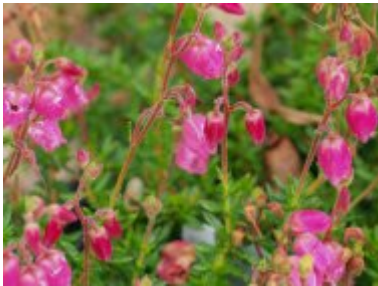
Daboecia 'Katherine's Choice'