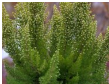
Erica arborea 'Estrella Gold'