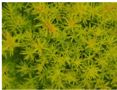
Erica arborea 'Albert's Gold'