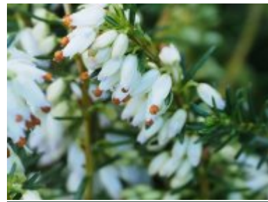
Erica carnea 'Winter Snow'