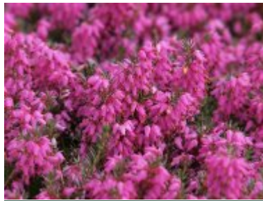
Erica carnea 'Rosalie'