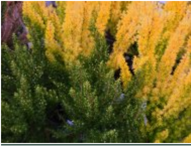
Erica arborea 'Estrella Gold' and 'Albert's Gold'