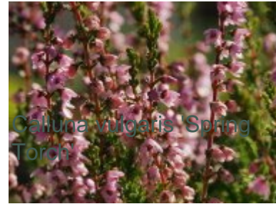
Calluna vulgaris 'Spring Torch'