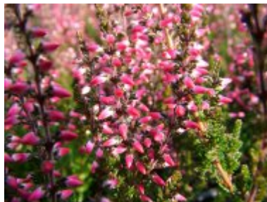
Calluna vulgaris 'Aphrodite'