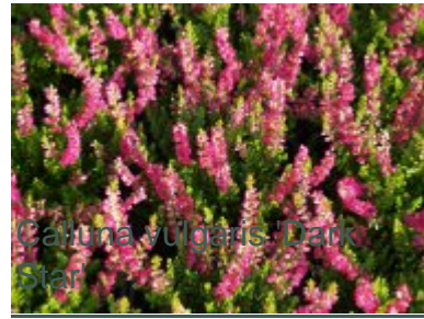
Calluna vulgaris 'Dark Star'