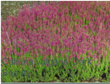
Calluna vulgaris 'Dark Beauty'