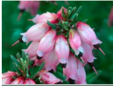
Erica erigena 'Irish Dusk'