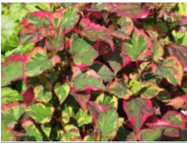
H. cordata 'Chameleon'