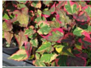
H. cordata 'Chameleon'