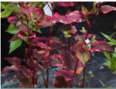
H. cordata 'Chameleon'