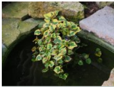
H. cordata 'Chameleon'