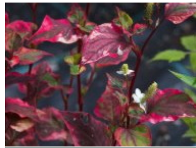
H. cordata 'Chameleon'