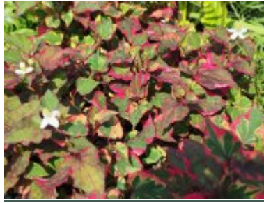
H. cordata 'Chameleon'