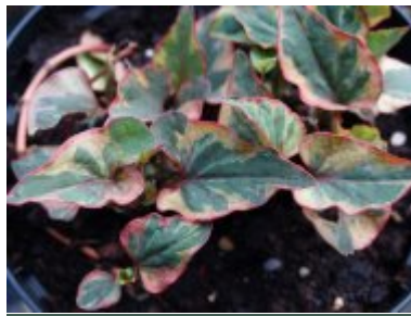
H. cordata 'Chameleon'