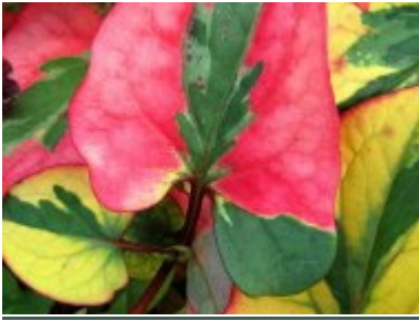
H. cordata 'Flame'