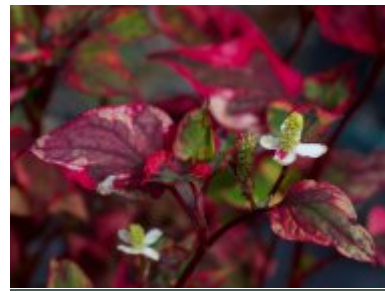
H. cordata 'Chameleon'