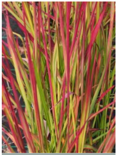
Imperata cylindrica 'Red Baron'