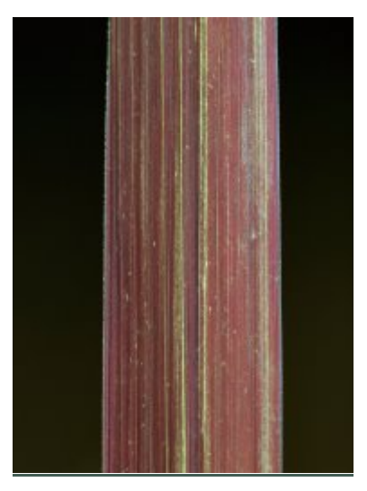
Imperata cylindrica 'Red Baron'

Burncoose Nurseries: Gwennap, Redruth, Cornwall TR16 6BJ Telephone: +44 (0) 1209 860316 Fax: +44 (0) 1209 860011 Email: info@burncoose.co.uk © Burncoose Nurseries 1997 - 2024