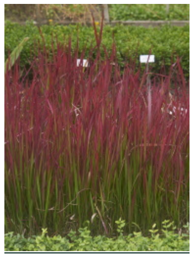
Imperata cylindrica 'Red Baron'