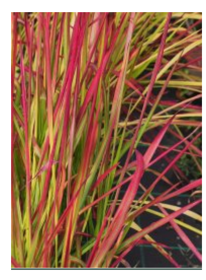
Imperata cylindrica 'Red Baron'