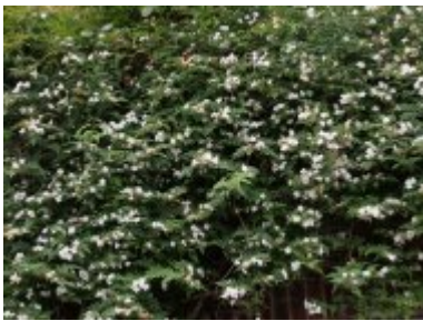
Jasminum officinale affine

With us in Cornwall J. officinale is usually evergreen or nearly evergreen. In most of the rest of the country it is more likely to be deciduous.