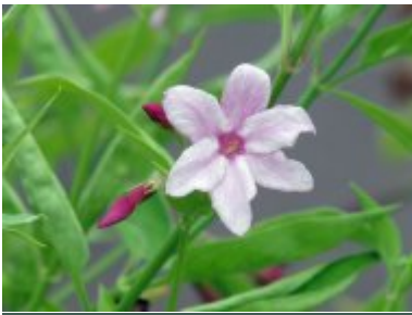
Jasminum x stephanense