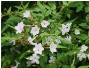
Jasminum officinale affine