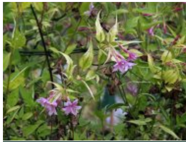
Jasminum x stephanense

J. azoricum is an evergreen twining species which can grow to 10ft or more on a wall in the greenhouse but will probably need to be cut back from time to time to keep it under control. Its fragrant white flowers appear in late summer from terminal cymes. Because it flowers on the new growth pruning will encourage more copious displays of flowers.