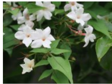
Jasminum officinale affine