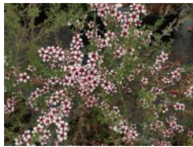
Leptospermum scoparium 'Nicholsii'