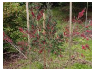
Leptospermum scoparium 'Red Damask'