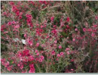
Leptospermum 'Burgundy Glow'