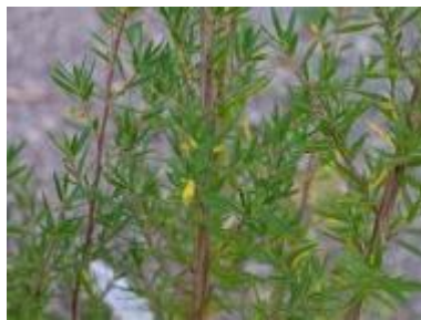
Leptospermum scoparium 'Snow Flurry'

Burncoose Nurseries: Gwennap, Redruth, Cornwall TR16 6BJ