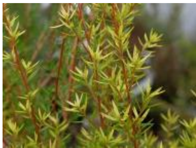
Leptospermum scoparium 'Snow Flurry'

Leptospermum 'Snow Flurry' – double white flowers in profusion.