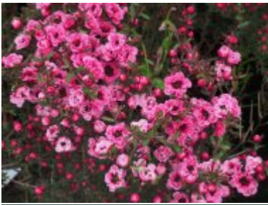
L.scoparium 'Winter Cheer'

If you are worried about the risks of a cold winter leptospermums are very easy to propagate.