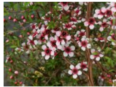
Leptospermum scoparium 'Nicholsii'

– huge double, long lasting, deep red flowers which was bred in California 70 years ago. Again it has lasted the test of time.