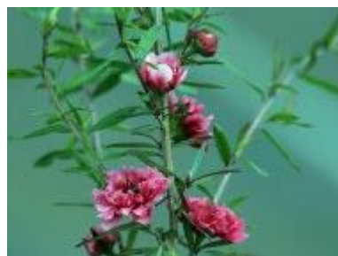
Leptospermum scoparium 'Red Damask'