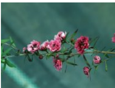
Leptospermum scoparium 'Red Damask'

– huge double, long lasting, deep red flowers which was bred in California 70 years ago. Again it has lasted the test of time.