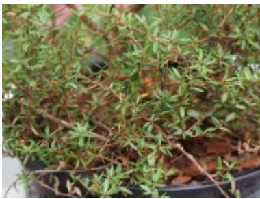
Leptospermum scoparium 'Nicholsii'

Leptospermum 'Nicholsii' – carmine red flowers and dark purplish-bronze foliage. First raised in 1904 but still popular and proven to be hardier than most varieties.