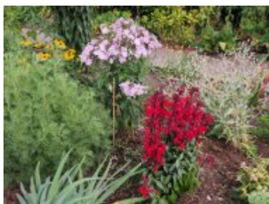
Lobelia cardinalis and Phlox paniculata 'Bright Eyes'