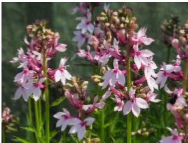
Lobelia 'Compton Pink'