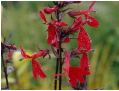
Lobelia cardinalis 'Queen Victoria'