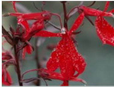
Lobelia cardinalis 'Queen Victoria'