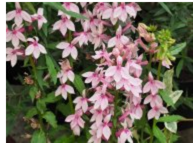
Lobelia 'Compton Pink'