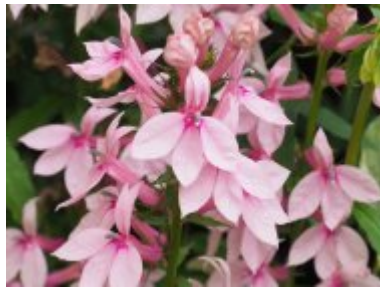
Lobelia 'Compton Pink'