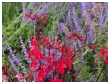
Lobelia cardinalis and Perovskia atriplicifolia