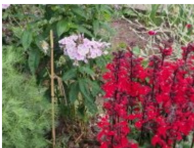
Lobelia cardinalis and Phlox paniculata 'Bright Eyes'