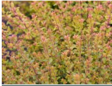
L. nitida 'Tidy Tips'