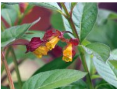
L. involucrata var. ledebourii