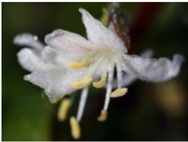
L. x purpusii 'Winter Beauty'