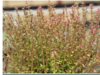
L. nitida 'Tidy Tips'