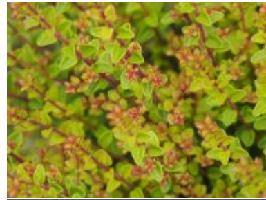
L. nitida 'Tidy Tips'