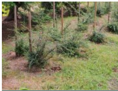
Recently planted L. nitida