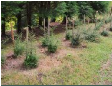
Recently planted L. nitida