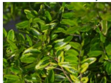
L. nitida 'Lemon Beauty'