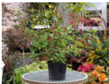
L. involucrata var. ledebourii