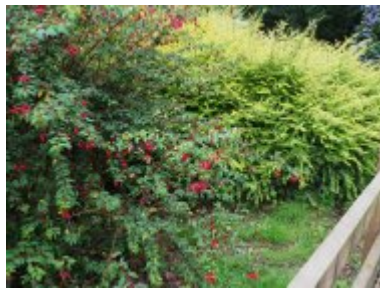
L. nitida 'Baggesen's Gold' and F. magellanica var. gracilis