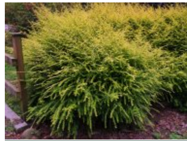
L. nitida 'Baggesen's Gold'