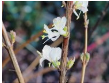
L. x purpusii 'Winter Beauty'