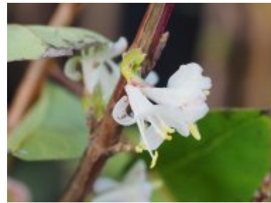
L. x purpusii 'Winter Beauty'