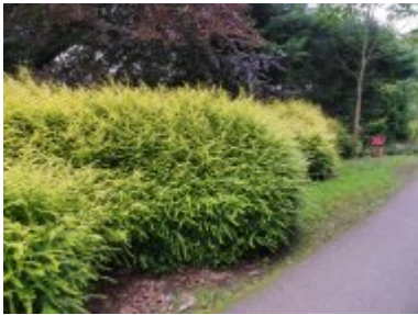
L. nitida 'Baggesen's Gold'