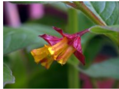
L. involucrata var. ledebourii