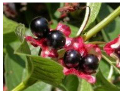
L. involucrata var. ledebourii

L. crassifolia is a creeping evergreen species suitable for the rockery. We grow it on an ancient tree stump the centre of which we have filled with soil. It is slow growing and relishes full sun in a hot dry location. It has rounded leathery leaves and the flowers appear in summer. These are