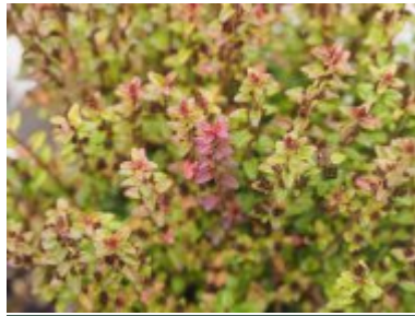
L. nitida 'Tidy Tips'