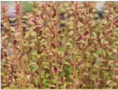
L. nitida 'Tidy Tips'