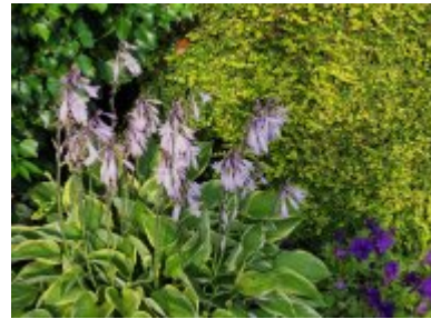
L. nitida 'Baggesen's Gold' and Hosta 'Liberty'