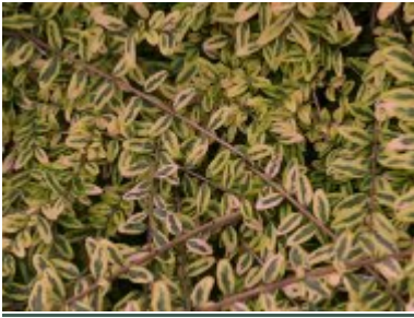
L. nitida 'Lemon Beauty'