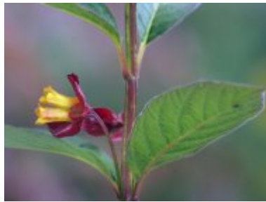
L. involucrata var. ledebourii