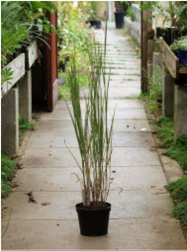
Panicum virgatum 'Heavy Metal'

Burncoose Nurseries: Gwennap, Redruth, Cornwall TR16 6BJ