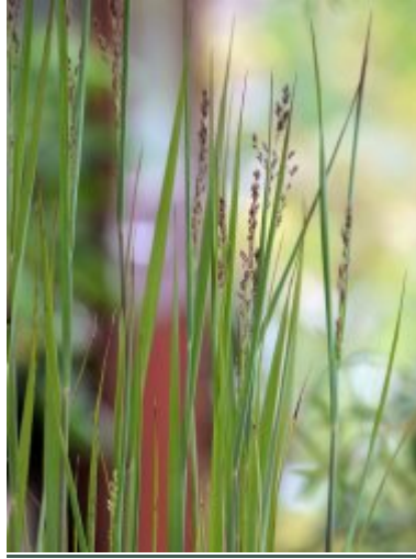
Panicum virgatum 'Heavy Metal'