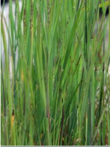
Panicum virgatum 'Heavy Metal'