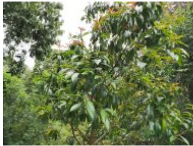
P. auxillaris var. tonkinense