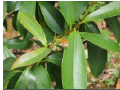
P. auxillaris var. tonkinense