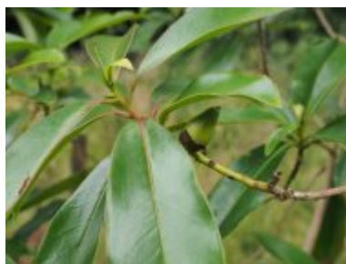
P. auxillaris var. tonkinense