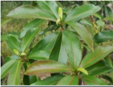
P. auxillaris var. tonkinense