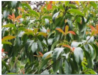
P. auxillaris var. tonkinense