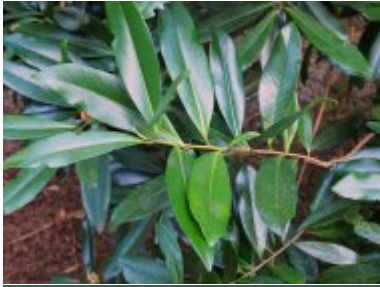
P. auxillaris var. tonkinense

Once we can get this new genus of plants properly into production they will be a sensation in our gardens and something really new to admire in the winter months with early camellias.