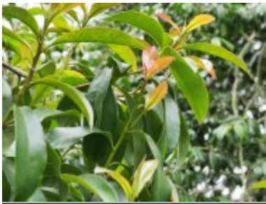
P. auxillaris var. tonkinense