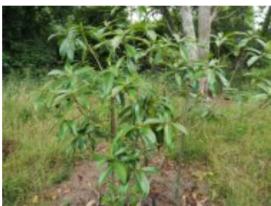
P. auxillaris var. tonkinense