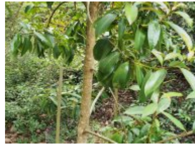
P. auxillaris var. tonkinense