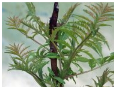
Rhus glabra 'Laciniata'