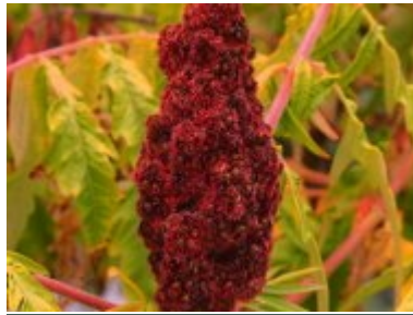
Rhus typhina 'Tiger Eyes'