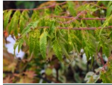
Rhus typhina 'Tiger Eyes'