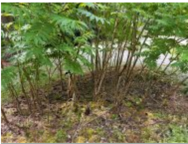
Rhus as a suckering clump

The two forms of this genus which we offer are both large suckering, clump forming, deciduous shrubs which originate in North America and are fully hardy. Rhus glabra , the scarlet sumach, and Rhus typhina , the stag's horn sumach, are grown for their attractive alternate pinnate leaves which turn a brilliant yellow or red in the autumn. Both have yellowish-green upright panicles of flowers at the tips of their new growth which are up to 10in long and appear in summer. On female plants the flowers are followed by dense clusters of spherical hairy crimson-red fruit.