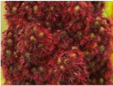
Rhus typhina 'Tiger Eyes'