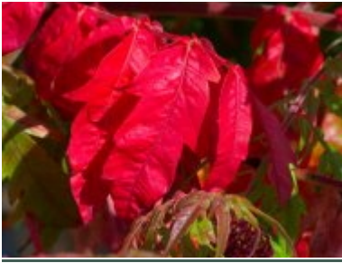
Rhus typhina 'Dissecta'