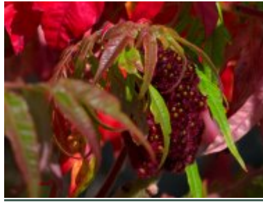
Rhus typhina 'Dissecta'