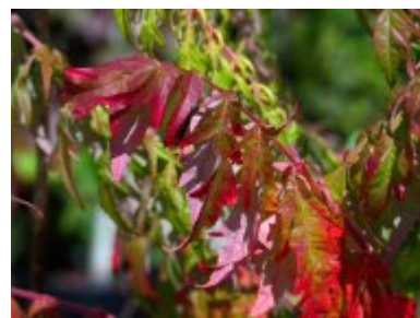
Rhus typhina 'Dissecta'