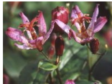
Tricyrtis hirta 'Taiwan Adbane'