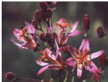
Tricyrtis hirta 'Taiwan Adbane'