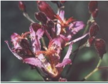
Tricyrtis hirta 'Taiwan Adbane'