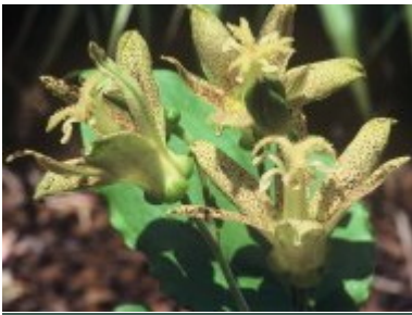
Tricyrtis latifolia 'Yellow Sunrise'