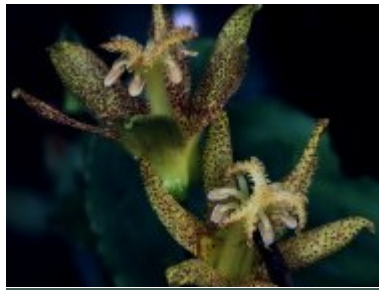
Tricyrtis latifolia 'Yellow Sunrise'

Burncoose Nurseries: Gwennap, Redruth, Cornwall TR16 6BJ