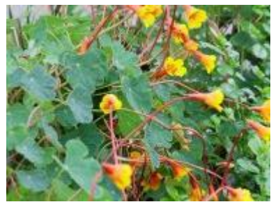
Tropaeolum 'Ken Aslett'

T. speciosum produces plenty of seeds which turn bright blue when ripe. The plant will self seed and expand quickly if it likes its home.