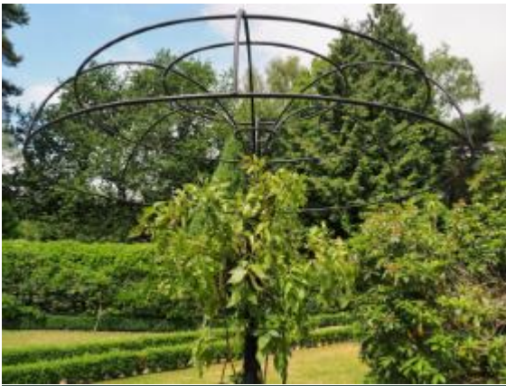
Wisteria revusta growing through an umbrella

Wisterias thrive in full sun or semi shade in moist but well drained soil. They will not flower well if grown in shade. Wisteria can be trained up dead trees or even live ones with enough care each year to train the new growth tendrils ever upwards. They are however most commonly grown on sunny south facing walls where they need trellis and/or wires to hold them in place. Wisterias can also be grown as free standing 'umbrella' plants within a circular wire surround or over a trellis or archway. A variety of these excellent wisteria supports are available from Harrod Horticultural.