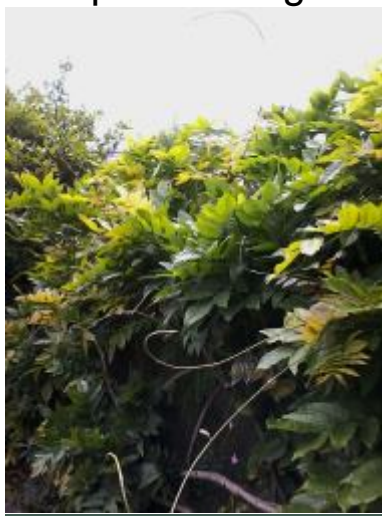
July before pruning

Immediately after flowering, when the spurs and tendrils of new growth are growing away exponentially, is the time to ensure good flowering next season. You are aiming not just to train and control the plant as and where you want it to grow but, more crucially, to avoid the plant wasting energy on new growth shoots which will not produce any flowers next year. So prune out the soft and whippy new growth to about 6". Leave unpruned the growths needed to fill the trellis or wires in the shape you want. There may well be a lot of new growth to remove and this includes growth and vigorous shoots from the base of the plant or even from root suckers at ground level where the roots are forced above the soil level and exposed to light. This is common in older wisteria.