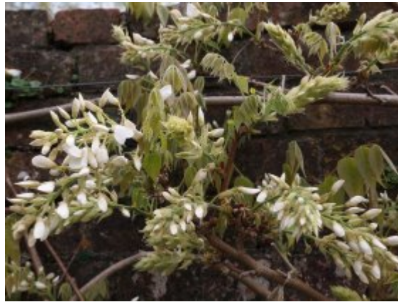
Wisteria venusta 'Shiro-kapitan'