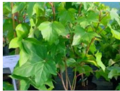
x Fatshedera lizei