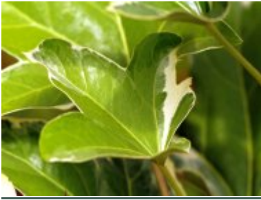
x Fatshedera lizei