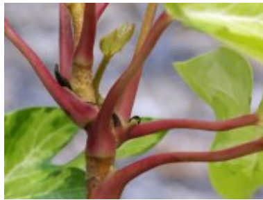
x Fatshedera lizei 'Annemieke'