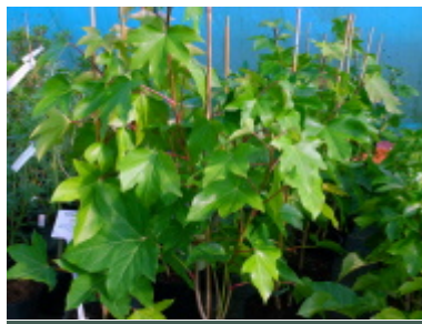
x Fatshedera lizei