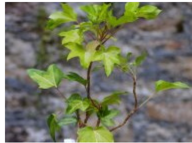
x Fatshedera lizei 'Annemieke'