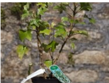
x Fatshedera lizei 'Variegata'