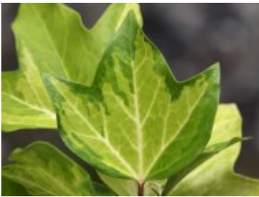
x Fatshedera lizei 'Annemieke'