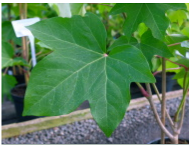
x Fatshedera lizei

x Fatshedera lizei is a cross between Fatsia japonica and Hedera hibernica (Irish ivy). It is commonly known as the 'tree ivy' and has a spreading loosely branched appearance. The palmate leathery leaves are dark green with five or seven lobes. In autumn it produces sterile greenish white flowers in panicles or umbels. It will grow eventually to about 10ft in height with a spread of 4-6ft. If you want to cover a wall, fence or pergola with something rather less invasive and slower growing than just ivy then this may well be the evergreen for you.