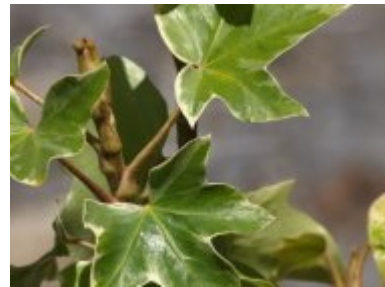
x Fatshedera lizei 'Variegata'