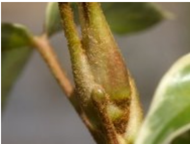
x Fatshedera lizei 'Variegata'