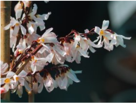
Abeliophyllum distichum 'Roseum'

Burncoose Nurseries: Gwennap, Redruth, Cornwall TR16 6BJ