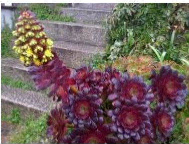
Aeonium arboreum 'Schwarzkop'

It is easy enough to think of this plant as a small growing succulent but, if grown in a sheltered enough and frost free location, it can and readily will develop into a 6ft tall erect but branching shrub. The rosettes of spoon shaped dark black leaves will become 6in or more long. In spring the plant produces a tall flower spike with large panicles (12in long) of many bright yellow flowers. These are most attractive offset by the black leaves.