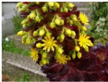
Aeonium arboreum 'Schwarzkop'