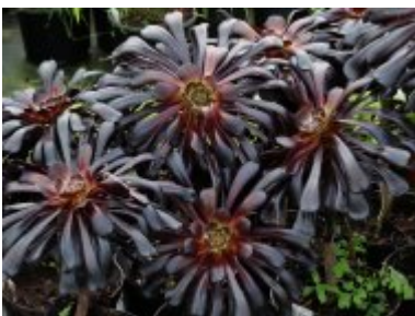
Aeonium arboreum 'Schwarzkop'