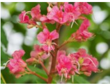
A. x carnea 'Briotii'