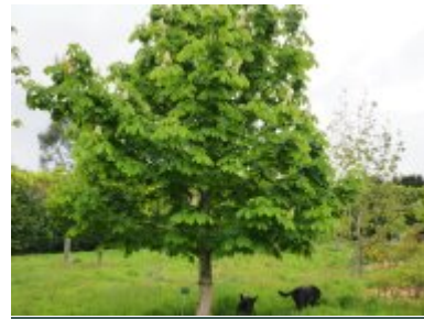
A. hippocastanum 'Baumannii'