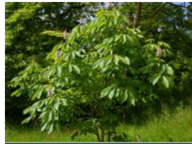
A. indica 'Sydney Pearce'