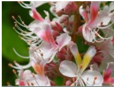
A. indica 'Sydney Pearce'