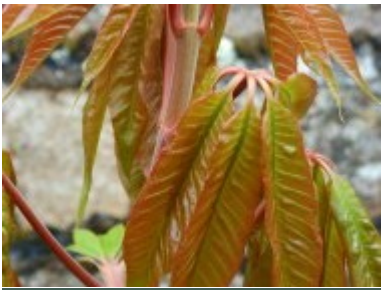
A. indica 'Sydney Pearce'