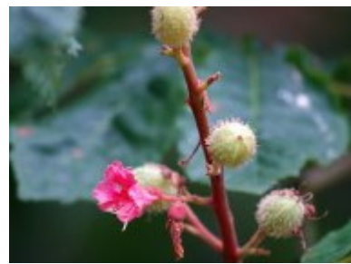
A. x carnea 'Briotii'