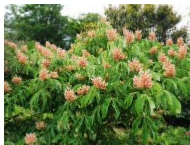
A. x mutabilis 'Induta'