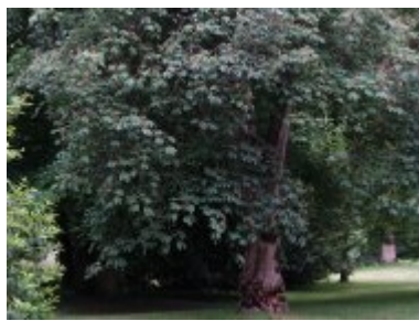
A. x carnea 'Briotii'