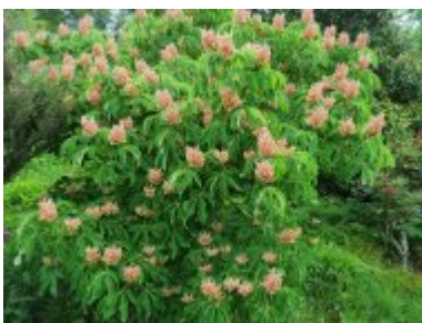
A. x mutabilis 'Induta'

Aesculus x mutabilis 'Induta' was one of the stars of the show gardens at Chelsea 2019. This is a slow growing shrub which is ideal for the smaller garden and has apricot coloured flowers with yellow markings.