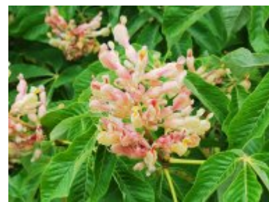
A. x mutabilis 'Induta'

A. pavia, the red buckeye, is another beautiful large shrub with crimson-red flowers. A. chinensis, the Chinese horse chestnut, has long slender cylindrical racemes.