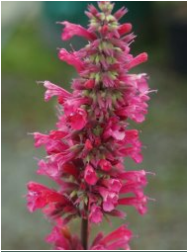
A. mexicana 'Red Fortune'

Burncoose Nurseries: Gwennap, Redruth, Cornwall TR16 6BJ