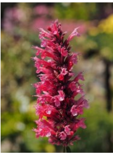
A. mexicana 'Red Fortune'