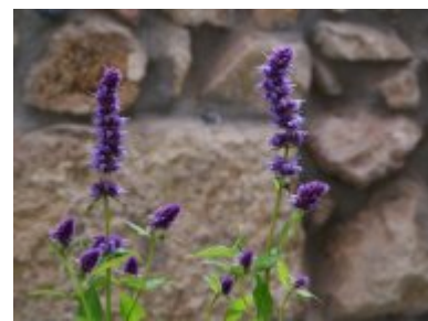
A. foeniculum 'Blue Fortune'