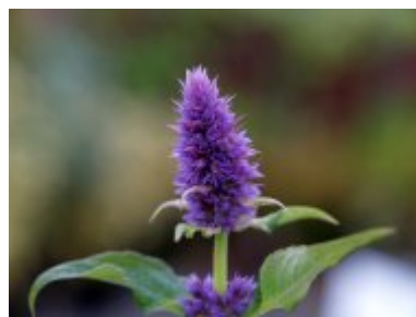
A. foeniculum 'Blue Fortune'