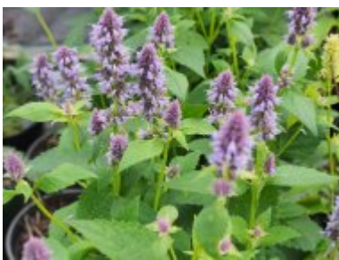
A. foeniculum 'Blue Fortune'

A. foeniculum 'Blue Fortune' and 'Alabaster' flower from July to September and grow 3ft or more including the flower spikes. Staking is probably unnecessary for individual clumps. The leaves are anise scented.