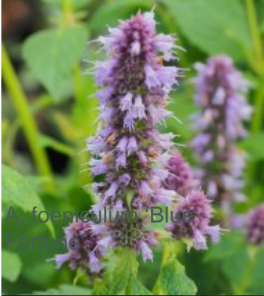
A. foeniculum 'Blue Fortune'