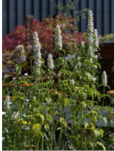
A. foeniculum 'Alabaster'