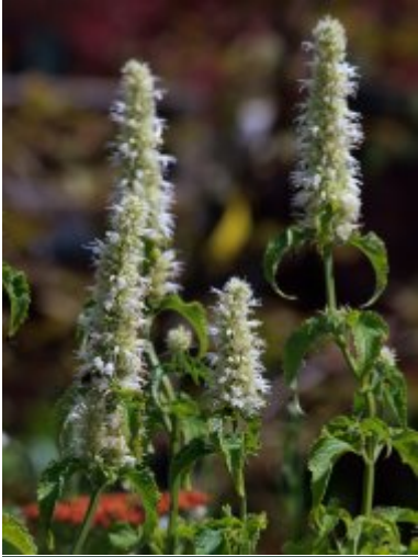
A. foeniculum 'Alabaster'