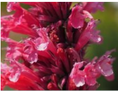
A. mexicana 'Red Fortune'