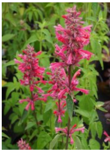
A. mexicana 'Red Fortune'