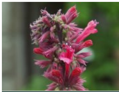
A. mexicana 'Red Fortune'