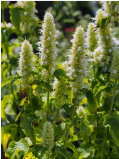
A. foeniculum 'Alabaster'