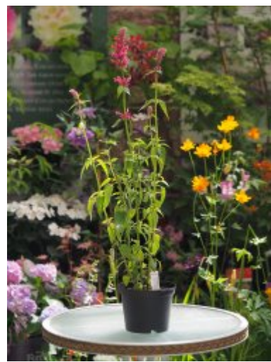
A. mexicana 'Red Fortune'