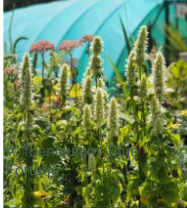
A. foeniculum 'Blue Fortune'