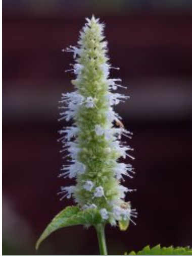
A. foeniculum 'Alabaster'