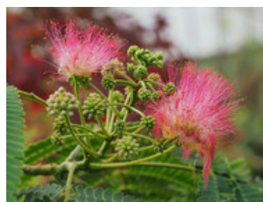
Albizia julibrissin 'Ombrella'