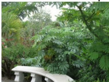
Albizia julibrissin 'Ombrella Melianthus major'

Red spider mite can be a problem if these plants remain in the greenhouse for years. It is best to stand them outside in the summer months to avoid the problem.