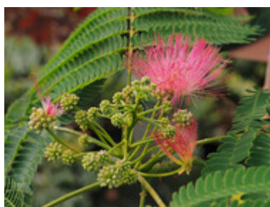
Albizia julibrissin 'Ombrella'