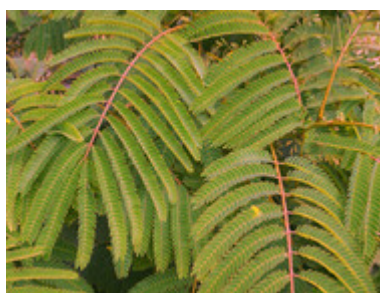
Albizia julibrissin 'Rosea'