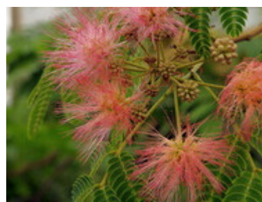
Albizia julibrissin 'Rosea'