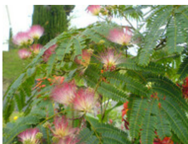
Albizia julibrissin 'Rosea'