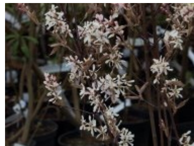
A. x grandiflora 'Robin Hill'