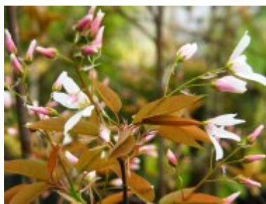
A. x grandiflora 'Robin Hill'