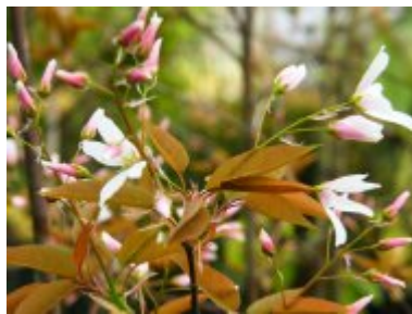
A. x grandiflora 'Robin Hill'