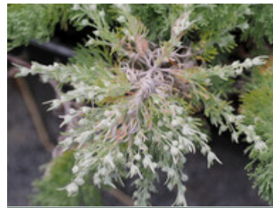
Artemisia schmidtiana 'Nana'