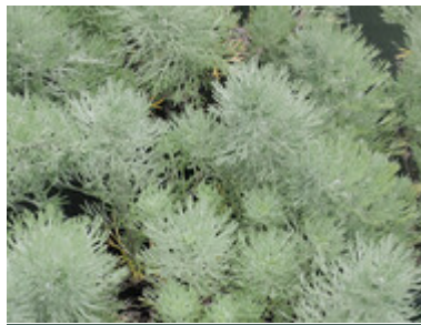
Artemisia schmidtiana 'Nana'