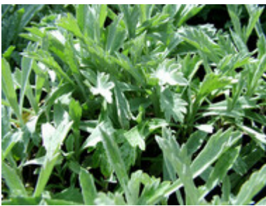
Artemisia ludoviciana 'Silver Queen'

A. ludoviciana 'Silver Queen' is a rhizomatous perennial from N. America growing up to 3 or 4ft eventually from a 2ft wide clump. It has lance shaped leaves which are covered with a silvery-white down. This makes an excellent contrast with other nearby herbaceous plants which grow to a similar or taller height and have green leaves or colourful flowers. The flower heads in late summer are brownish-yellow.