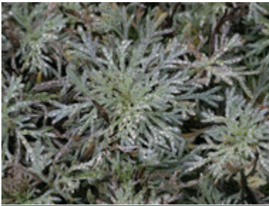
Artemisia schmidtiana 'Nana'