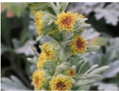
Artemisia stelleriana 'Boughton Silver'