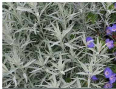
Artemisia ludoviciana 'Silver Queen'