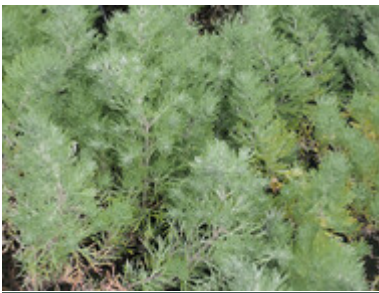
Artemisia schmidtiana 'Nana'