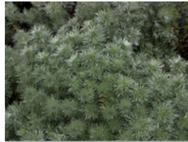
Artemisia schmidtiana 'Nana'