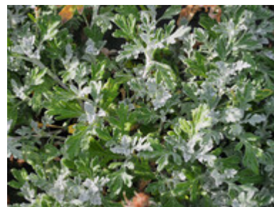
Artemisia stelleriana 'Boughton Silver'