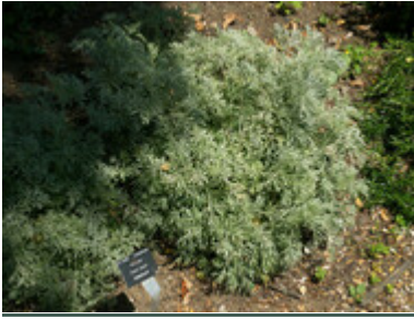
Artemisia 'Powis Castle'