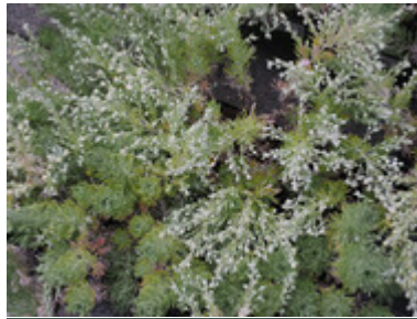
Artemisia schmidtiana 'Nana'