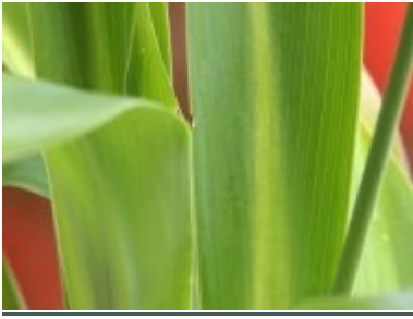
A.cirratum 'Matapouri Bay'