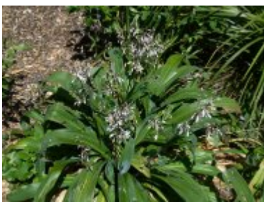
A.cirratum 'Matapouri Bay'

Under glass this plant should be grown in a loamy potting compost with plenty of sand or grit. Water frequently and feed a liquid fertiliser in the growing season and water sparingly in winter.