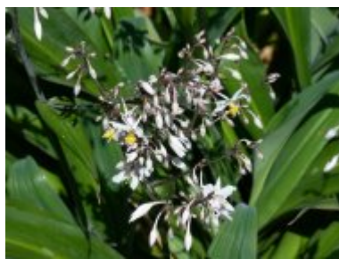
A.cirratum 'Matapouri Bay'