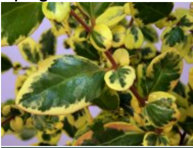
Azara integrifolia 'Variegata'

Propagation is best from semi-ripe cuttings in the summer.