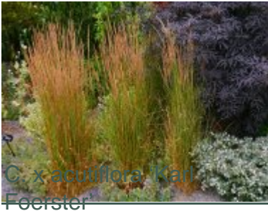
C. x acutiflora 'Karl Foerster'