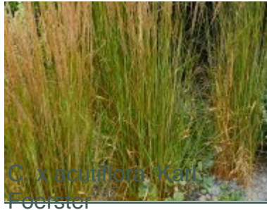
C. x acutiflora 'Karl Foerster'