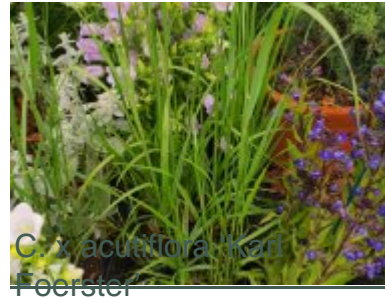
C. x acutiflora 'Karl Foerster'