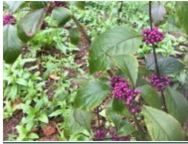
C. bodinieri var. giraldii 'Profusion'