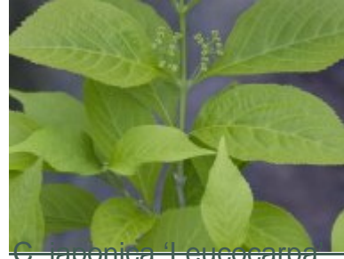
C. japonica 'Leucocarpa'