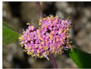
C. bodinieri var. giraldii 'Profusion'