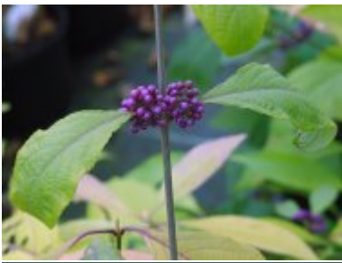
C. bodinieri var. giraldii 'Profusion'