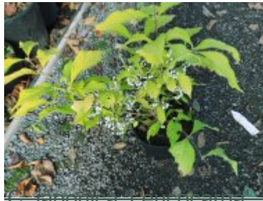
C. japonica 'Leucocarpa'