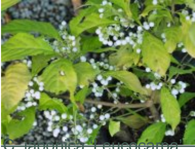
C. japonica 'Leucocarpa'