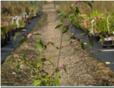
C. bodinieri var. giraldii 'Profusion'