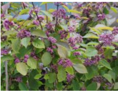
C. bodinieri var. giraldii 'Profusion'

C. bodinieri var. giraldii 'Profusion' is rightly the most impressive and popular of the Callicarpas. It has bronze young leaves and is the most free fruiting form with standout dense clusters of violet fruits.