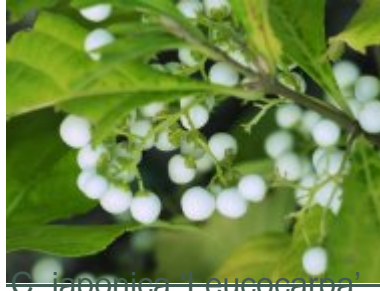
C. japonica 'Leucocarpa'