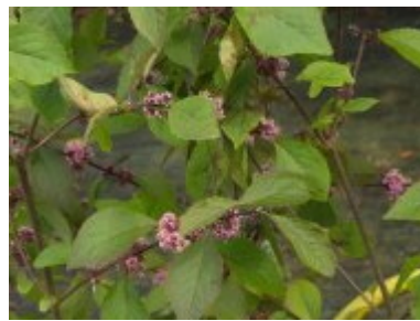
C. bodinieri var. giraldii 'Profusion'