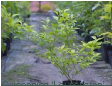
C. japonica 'Leucocarpa'