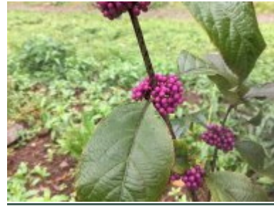
C. bodinieri var. giraldii 'Profusion'