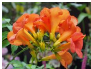
Campsis x tagliabuana 'Madame Galen'