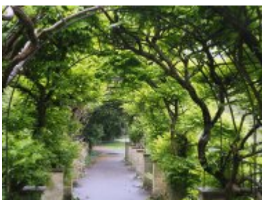
Campsis radicans grown on a pagoda