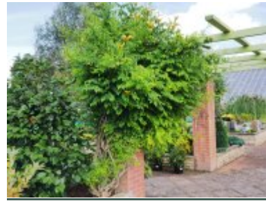
Campsis 'Yellow Trumpet'