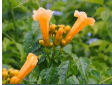
Campsis 'Yellow Trumpet'

View this video on Youtube here https://www.youtube.com/9_XWgQIIIDs