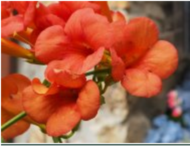
Campsis x tagliabuana 'Madame Galen'