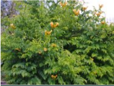
Campsis 'Yellow Trumpet'