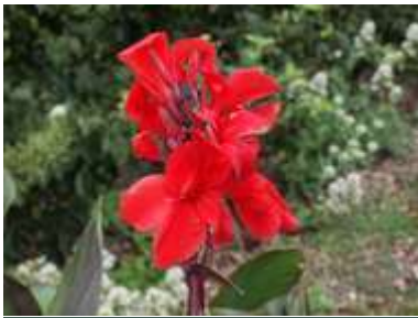
Canna 'King Humbert'