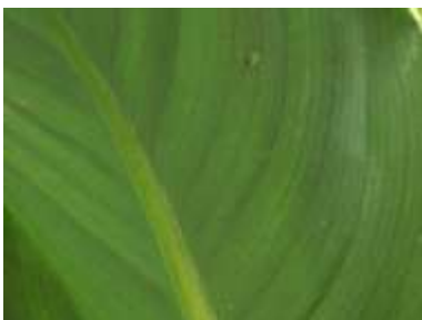
Canna 'King Humbert'