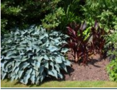
C.'Tropicana Black' & Hosta 'Halcyon'