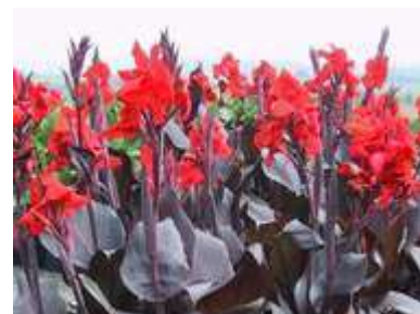
Canna 'Tropicana Black'