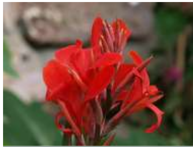
Canna 'King Humbert'