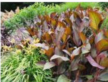
Canna 'Tropicana Black'