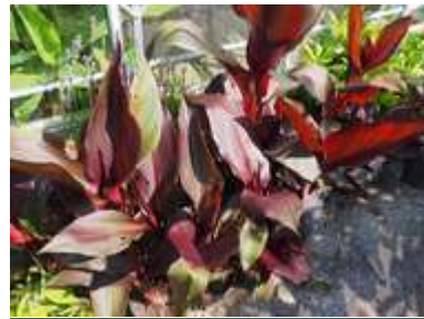
Canna 'King Humbert'