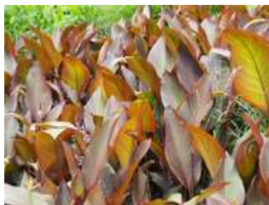
Canna 'Tropicana Black'