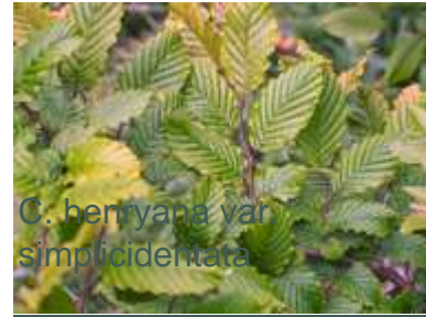
C. henryana var. simplicidentata