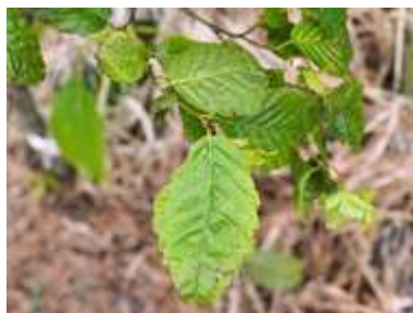
Carpinus 'Red Hill'