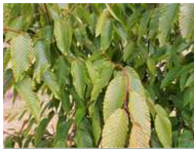
C. rankanensis - 2nd younger one

All Carpinus species are proving to be totally hardy and will grow as freestanding or woodland trees in fairly well drained soil. Carpinus betulus can (with a lot of effort) be grown as a hedge like beech or, as at RHS Garden Rosemoor, as a well-manicured and twice a year trimmed formal hedge of 18-20ft in height. C. betulus seeds (and other species) can be sown in the autumn in a seedbed. Carpinus can also be propagated from new shoot cuttings that have hardened off but winter casualties (as with many deciduous trees) are normal. Seed are easier.