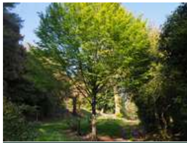
C. betulus 'Fastigiata'