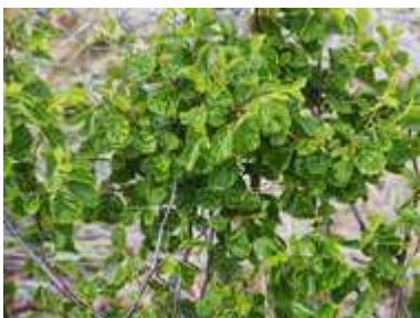
C. orientalis 'Perdice'