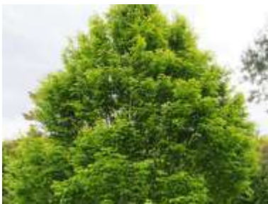
C. betulus 'Fastigiata'