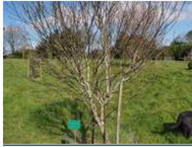
Carpinus rankanensis - young tree