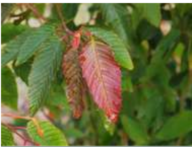
C. rankanensis - 2nd younger one