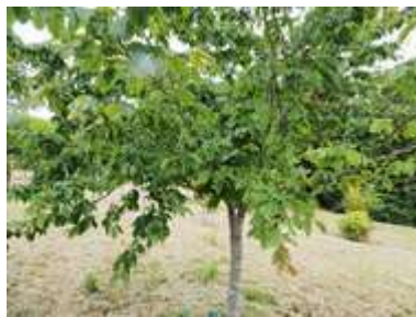
C. betulus 'Purpurea'