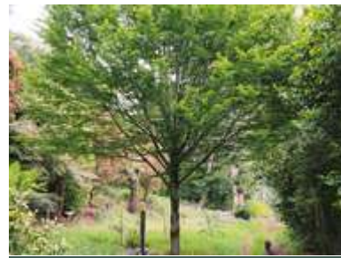
C. betulus 'Fastigiata'