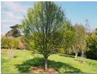
C. betulus 'Fastigiata'

For years hornbeams meant just (to us) the common or native Carpinus betulus and its improved forms which we have offered; such as Carpinus betulus 'Fastigiata'. Then came new grafted plants of the exceptional Carpinus fangiana with its enormous 'hop-like' flowers in profusion.