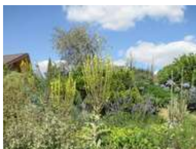
C. willmottianum & Verbascum olympicum