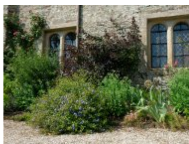
Ceratostigma & Cotinus 'Royal Purple'