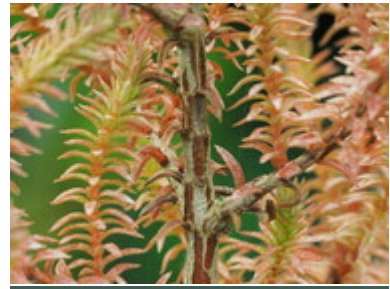
Chamaecyparis thyoides 'Rubicon'