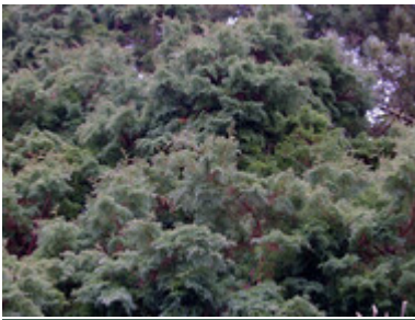
C. pisifera 'Squarrosa'