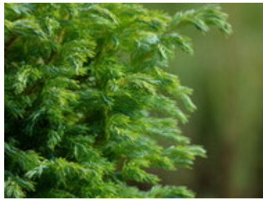
Chamaecyparis pisifera 'Boulevard'