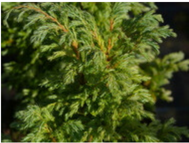
Chamaecyparis pisifera 'Boulevard'