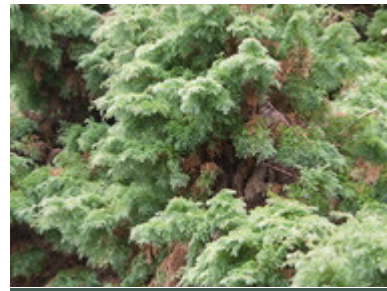
C. pisifera 'Squarrosa'