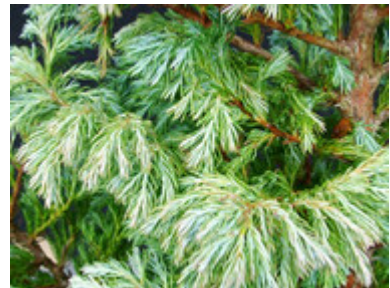
Chamaecyparis pisifera 'Boulevard'