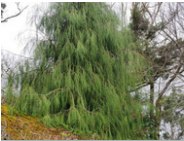
C. lawsoniana pendula