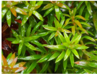
Chamaecyparis thyoides 'Rubicon'