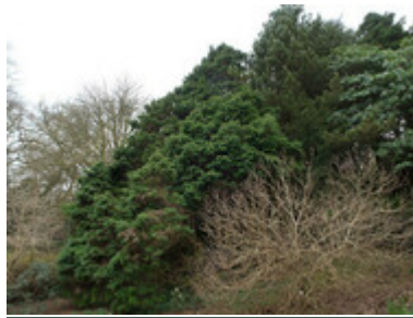
C. pisifera 'Squarrosa'

Burncoose Nurseries: Gwennap, Redruth, Cornwall TR16 6BJ