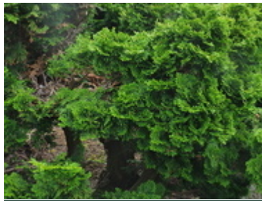
Chamaecyparis 'Nana Gracilis'