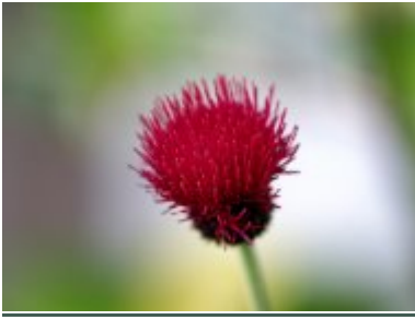
Cirsium rivulare 'Atropurpureum'

Burncoose Nurseries: Gwennap, Redruth, Cornwall TR16 6BJ