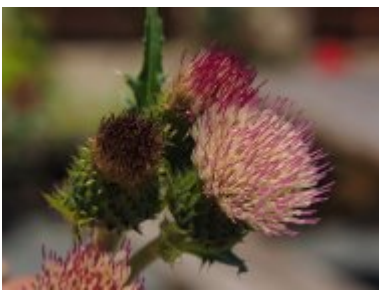
Cirsium 'Pink Blush'

The plant is easily divided to create new plants when dormant in winter or early spring. After a few years this is probably advisable in a border context as it spreads quickly.