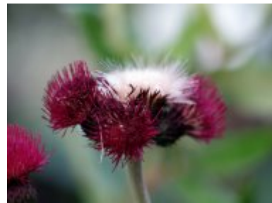
Cirsium rivulare 'Atropurpureum'